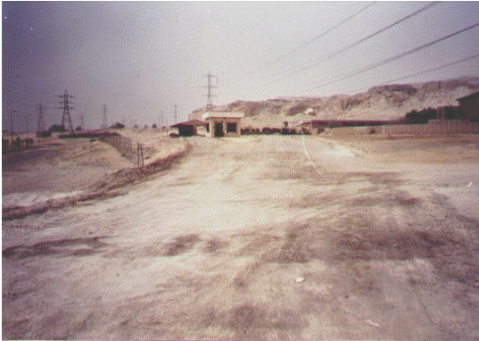
( a )