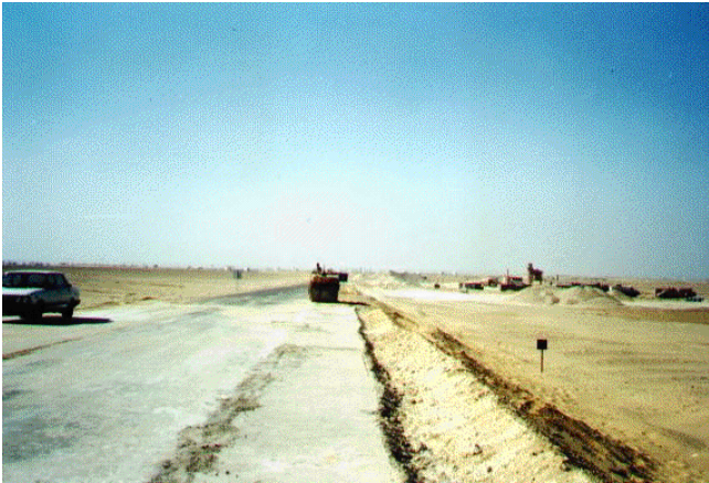
Fig.3 Stabilization of a sandy shoulder of an asphalt road after spreading of the upper surface layer containing BCD and during its compaction .