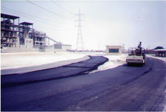
( b )