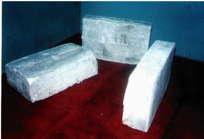
Fig.1. Curbstones made of by-pass cement dust at Factory 45 on semi-industrial scale with dimensions of 0.3 \times 0.2 \times 0.5 m.